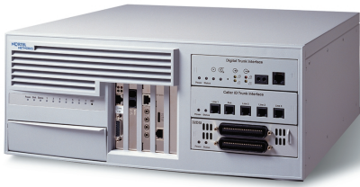
Business Communications Manager