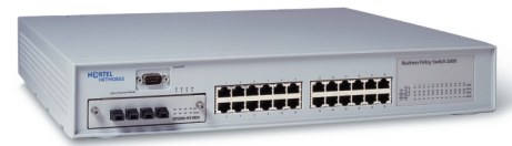
Business Policy Switch

Although SWTC had been providing both videoconferencing/distance learning and data networking services in the past, providing phone service and H.323-